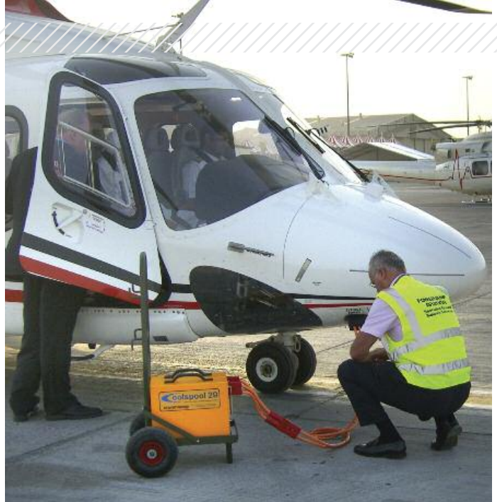
Coolspool 58: AW139 preflight and start

Typical power plant:* TPE 331, PT6-67, Arrius