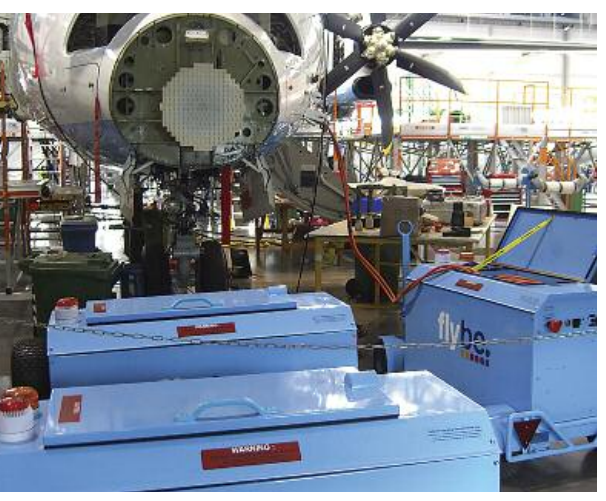
Coolspool 580: Q400 – supplying power during heavy

4-cable 70 mm (3in) section 4-metre (13ft) double-insulated output cable (for minimum voltage drop under very heavy load)