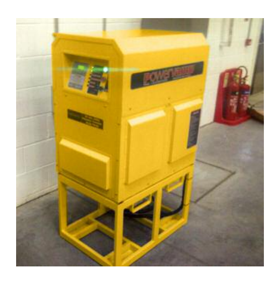
40 kVA fixed hangar power

• Heavy-duty 4-wheel ramp trolley with cable stowage and tow hitch