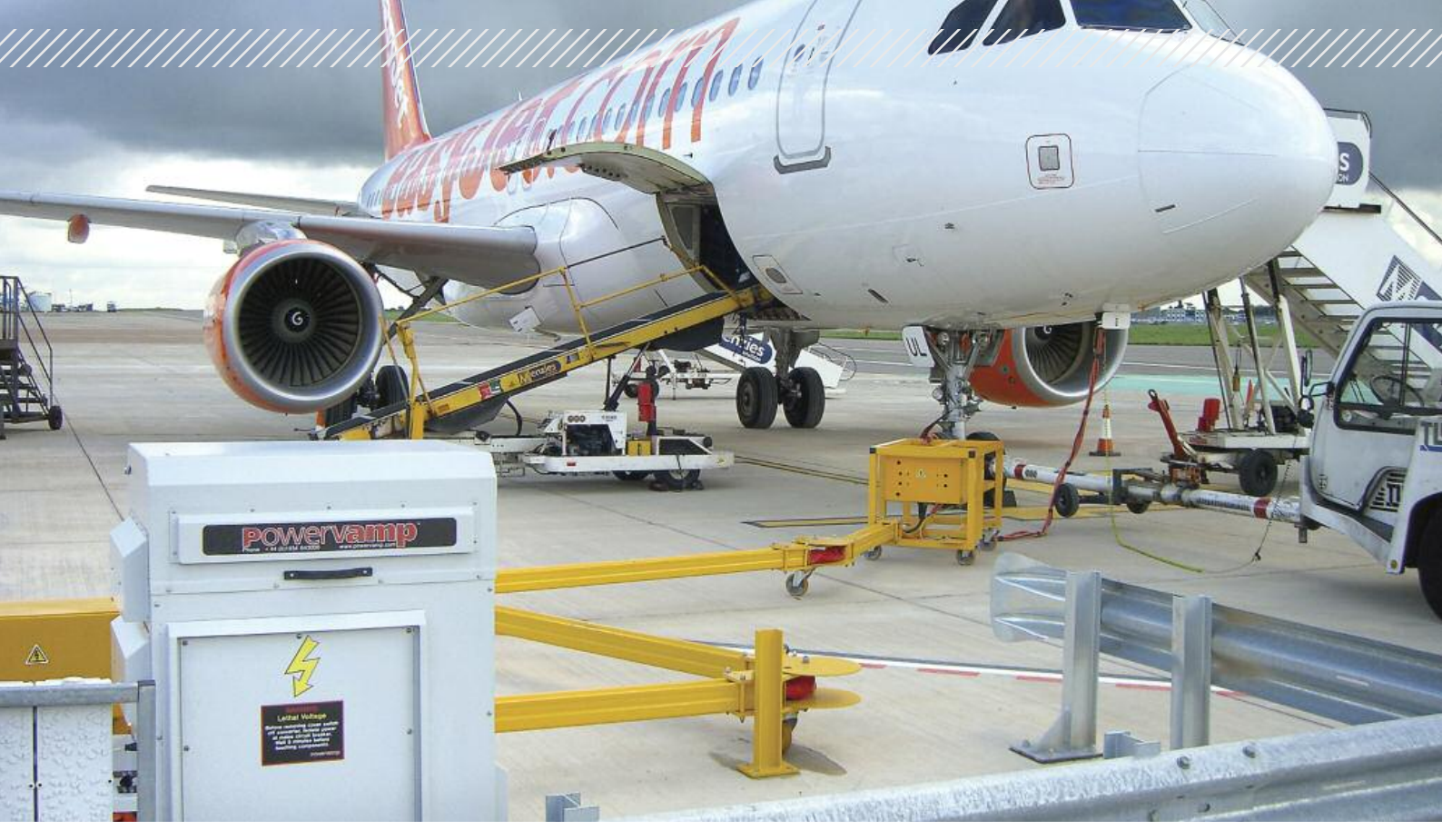
One of a batch of 90 kVA converters installed at Bristol airport