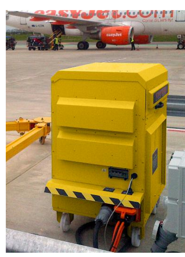
90 kVA showing MABS ethernet connection (see page 26)